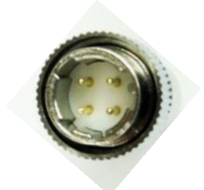
Front View of Male Connector