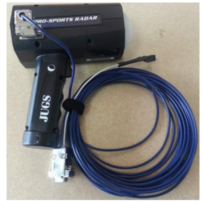
R2000 radar gun shown with the R2012 Cable.

Metalized ABS plastic Housing with thumb screws Norcomp 993-009-020-121