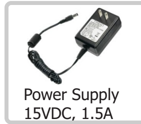
Power Supply 15VDC, 1.5A